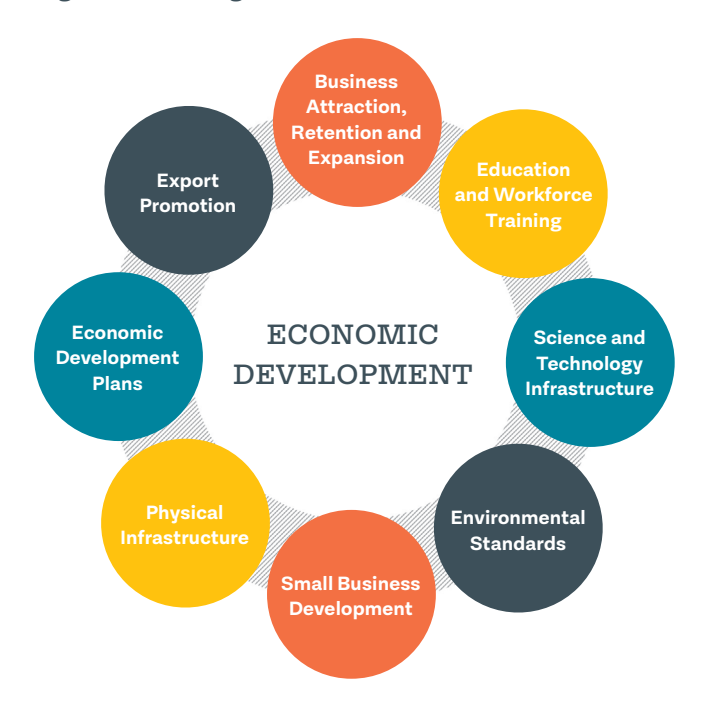
Figure 1. A Strategic Cluster Framework

A cluster includes closely related and interconnected industries operating within a specific geography. The companies operating within a cluster are connected by a shared workforce, supply chain, customers or technologies. Every cluster includes core businesses and industries, and the companies that support them, which forms a mutually beneficial business ecosystem. Clusters occur organically and reflect the unique assets and core competencies of a given region that create unique competitive advantages for certain industries.