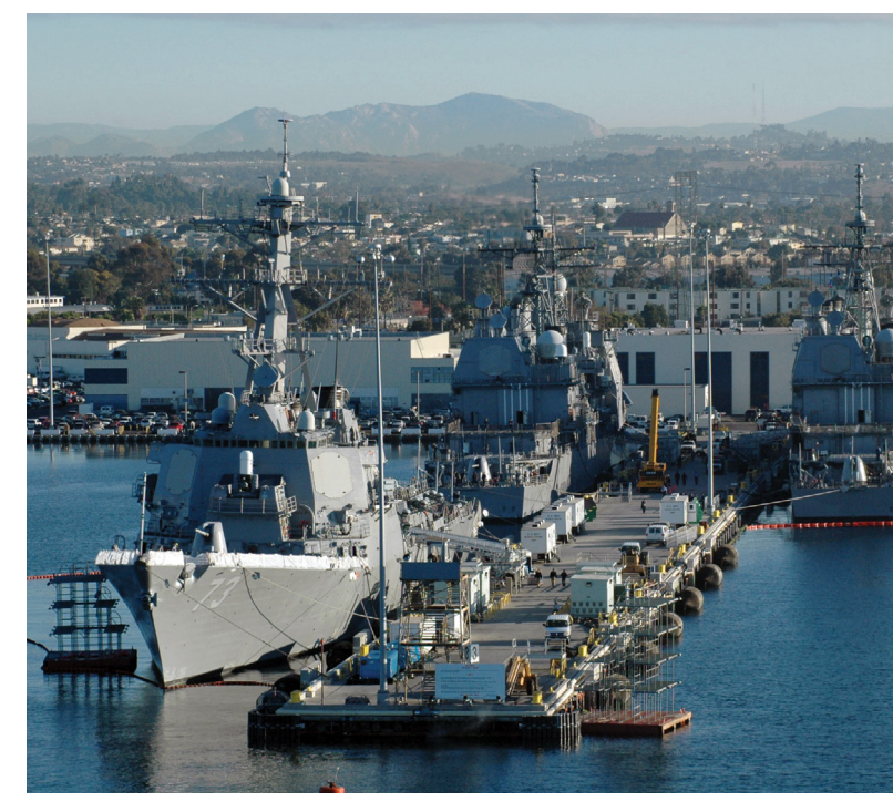
Naval Station San Diego

San Diego is home to the largest concentration of U.S. military assets in the world. The military and defense sector accounts for more than 22 percent of San Diego's GDP. There are numerous organizations within San Diego and San Diego County, including the San Diego Regional Economic Development Corporation and the San Diego Association of Governments, that actively support the growth of the very large defense cluster. SDRIC plays a relatively narrow, but important, role in supporting small businesses within C4ISR (command, control, communications, computers, intelligence, surveillance, and reconnaissance), cybersecurity, and autonomous systems.