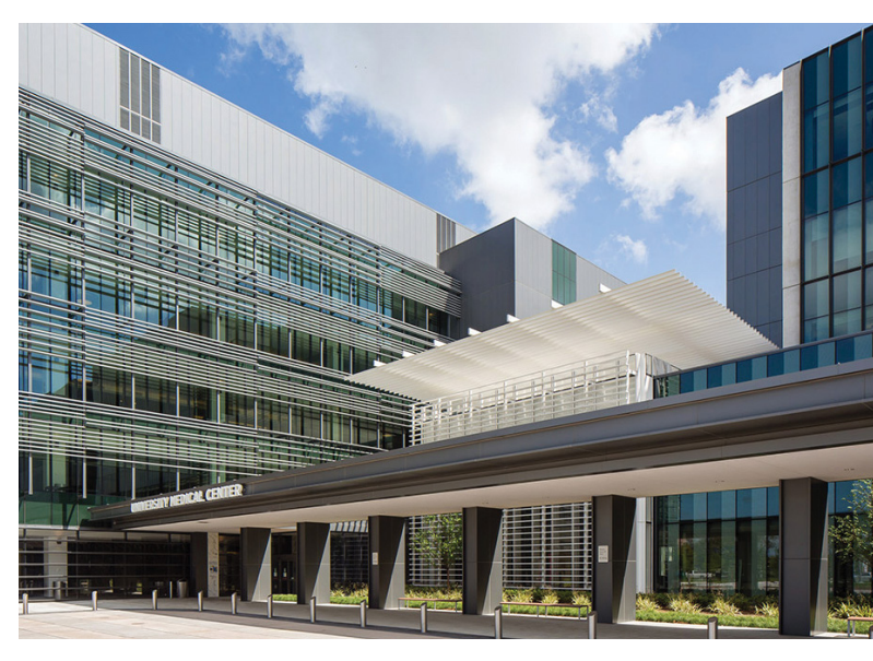
University Medical Center, New Orleans BioDistrict

NOLABA is also responsible for leading the implementation of ProsperityNOLA , and the plan guides the organization's activities. An independent 501(c)(3), NOLABA operates as a public-private partnership and is led by an 17-member board, composed of a cross section of